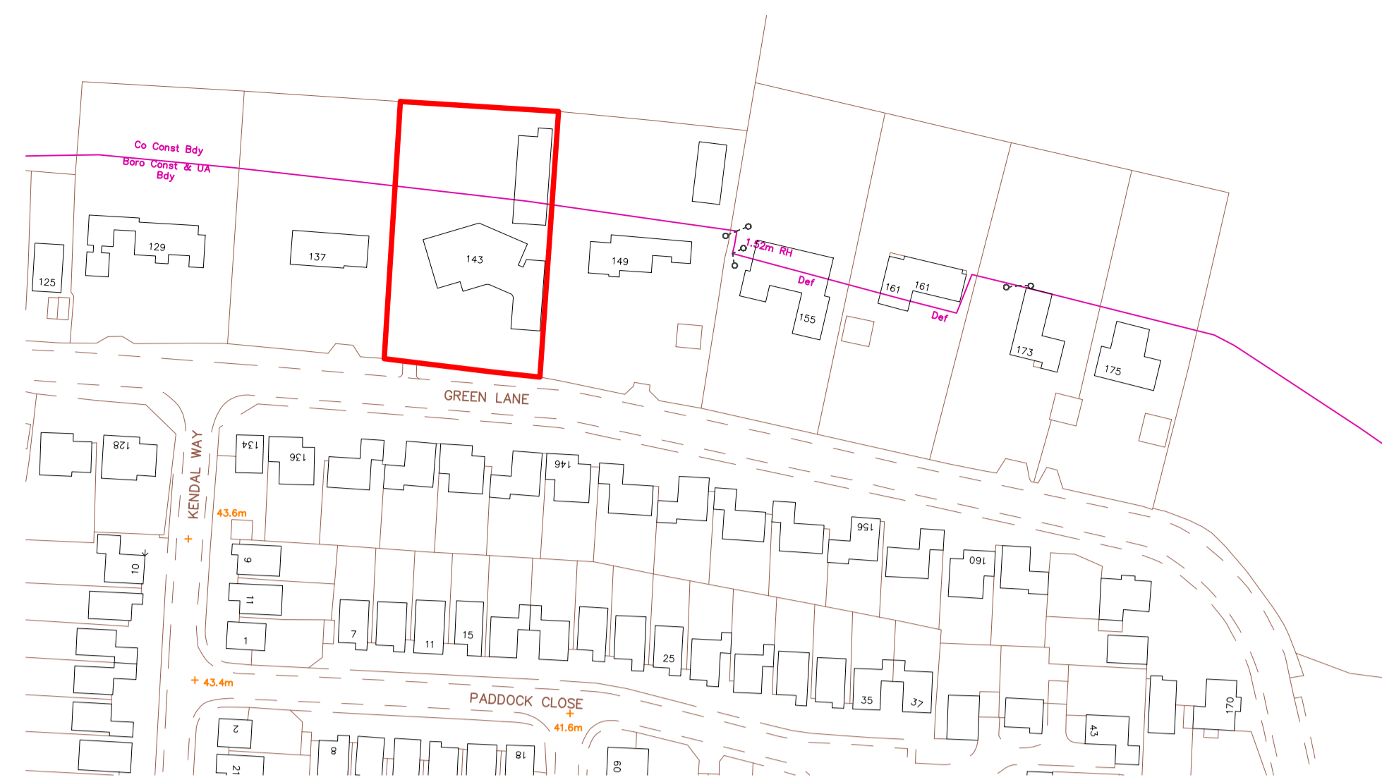
Proposed Location Plan - 1:1250